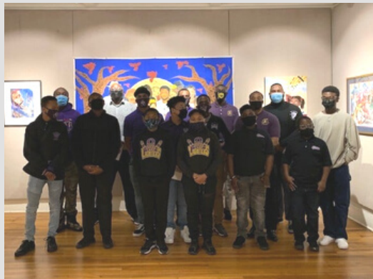
Omega Lamplighters enjoy a tour of our gallery during recent Civil Rights: Then and Now Exhibit.