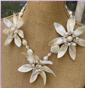
Hawaiian Flower Lei 20" Necklace, $250