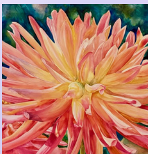
Cali Dahlias I Watercolor, 24" x 36", $1200