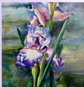
I got the Blues from Ron Watercolor, 36" x 24", $1200