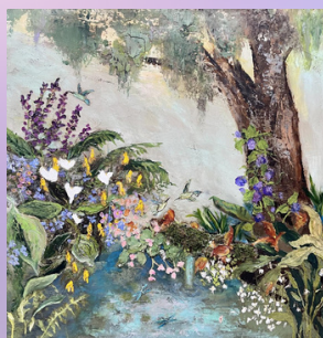
Spring Forest Acrylic on Wood, 48" x 48", $3600