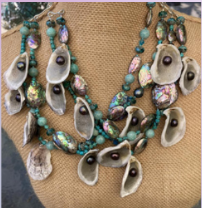
Oyster Mom's Oyster Cache 20" Necklace, $400

vibrant colors to express themselves is engaging. I always find myself moving towards "found objects" that create a story. Whether it be a collection of lockets, or a flotilla of exotic shells, I love creating a visual dialog that a person can wear."