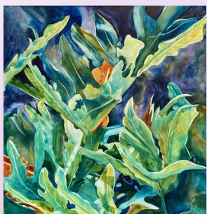
Mom's Split Leaf Watercolor, 24" x 24", $800

René Lynch is a watermedia artist who lives in Tallahassee, Florida. Extensive travel to tropical shores, including a yearlong sabbatical on the Garden Isle of Kauai, provides an endless array of subject matter. "Color, rhythm and value; these are the driving forces behind my work. I see lushness all around me, and I want to capture it, process it and throw it back out onto the surface. As I travel through the tropical landscape, I see colors so ripe that I can almost taste them, and I want to convey that sensation to those who view my work. Using water and earth-based media that mimic the organic qualities of my subject matter, I try to recreate the exuberance of our natural world."