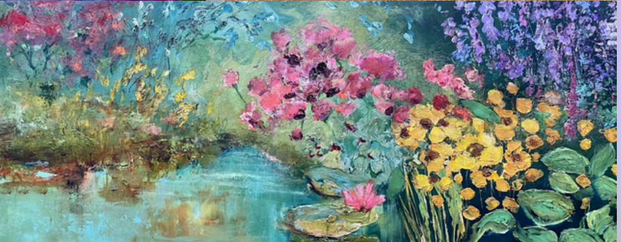
René Lynch, Blue Iris, April , Watercolor, 22" x 30"