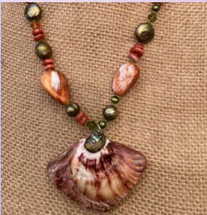
Spondylus Pendant 24" Necklace, $175