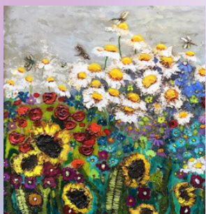
Tower of Daisies Acrylic on Wood, 30" x 36", $1600

Anne Hempel creates all her work on hand-crafted wood panels that her husband builds for her. She applies multiple layers of thickened acrylic paint creating an impasto style that reflects light and adds expressiveness to the painting. She uses glazes and washes in between layers to build rich color and highlight the texture. The wooden canvas makes the perfect surface for using a palette knife and various tools to carve into the wet paint creating a kind of three-dimensional sculptural rendering. "I'm fearless when it comes to experimenting with color and texture, my technique is always evolving. I live in a swampy, heavily wooded area with trails and boardwalks leading to endless natural vignettes that offer inspiration. Occasionally I like to hide a song lyric in a nest or embed a treasure found outdoors (a leaf, wing, feather, etc.) in a painting to capture my love for music and nature in my work."