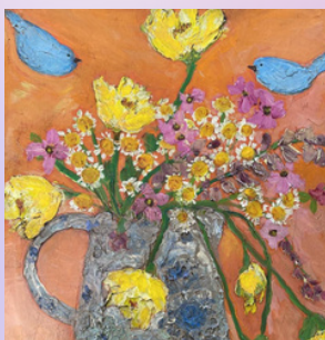
Yellow Flowers Open My Heart Acrylic on Wood, 24" x 18", $675