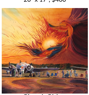
Phoenix Rising, Michele Tabor, 29" x 37", $2100