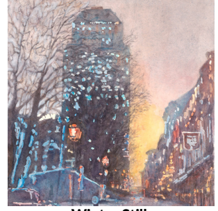
Winter Still, Harold Griner, 21" x 17.5", NFS