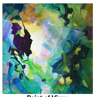
Point of View, Nancy Dias, 38" x 30", NFS