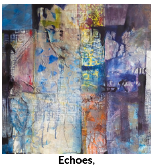
Echoes, Lynne Kroll, 28" x 36", $1200