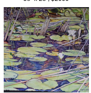
Lily Pads 2 , Suzanna Winton, 33" x 47", $3500