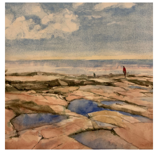
Schoodic Point, Yoshiko Murdick, 21" x 28", $600