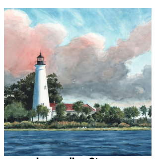
Impending Storm, Duke Kraai, 24" x 30", $650