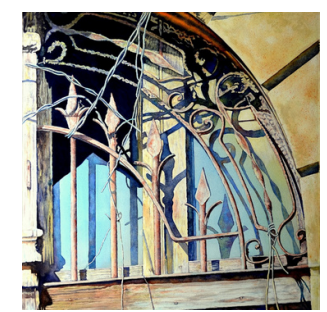
Wired In-Havana, Don Taylor, 36" x 28", $1500