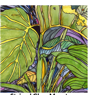
Stained Glass Monstera, Eva-Lynn Powell, 15.5" x 20", $350