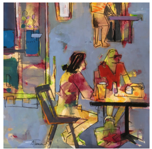
Café Society, Brenda Turner, 36" x 30", $2000