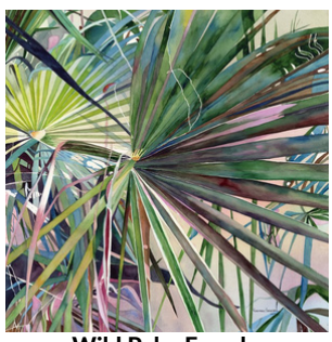
Wild Palm Fronds, Rosemary Ferguson, 39" x 29", $1500