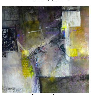
Innuendo, Lynne Kroll, 28" x 36", $1200