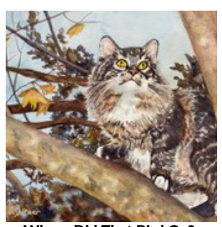
Where Did That Bird Go?, Janis Spitzer, 17" x 20.5", $300