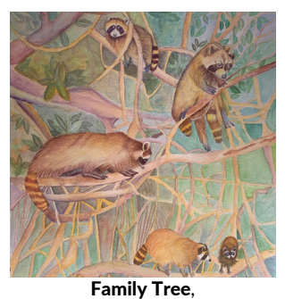
Patricia Colson, 21" x 28 3/8", $500