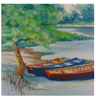
Three Boats and a Cat, Autry Dye, 21" x 29", $600