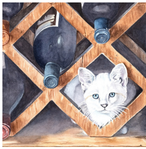
The Sommelier, Fran Dellaporta, 26" x 20", $750