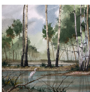
Snowy Egret in the Cathedral, Phillip Pollock, 16" x 20", NFS