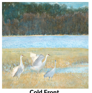
Cold Front, Harold Griner, 26" x 33", $1375