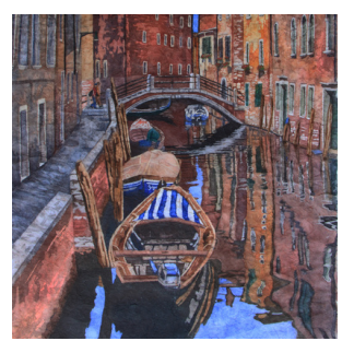
Tranquil Canal, Gail Watson, 36" x 28", $2000