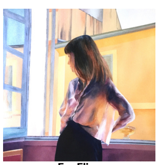
For Elise, Cheryl Fausel, 24" x 24", NFS