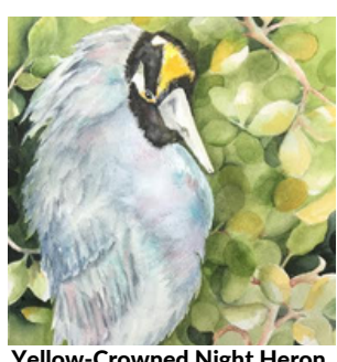
Yellow-Crowned Night Heron, Nancy Larkin, 25" x 16", $600