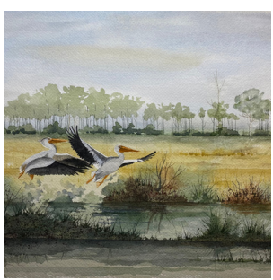
White Pelicans at the Refuge, Phillip Pollock, 16" x 20", NFS