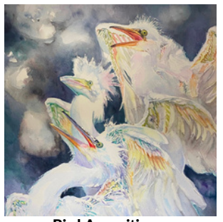
Bird Apparitions, Sherry Allen, 37" x 31", NFS