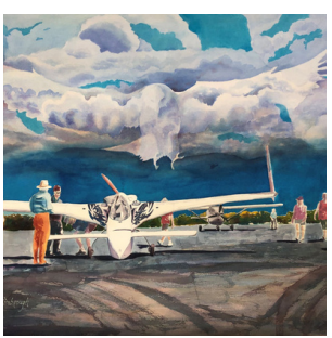
Freedom to Fly, Michele Tabor, 29" x 37", $2100