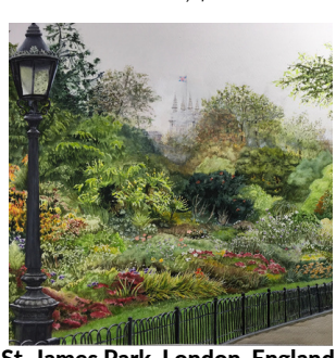
St. James Park, London, England , Barbara Buckingham, 20" x 26.5", NFS