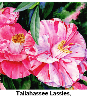
Tallahassee Lassies, Elena Scibelli, 22" x 26", $850