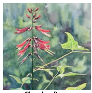
Cherokee Bean, Janis Spitzer, 20.5" x 17", $300