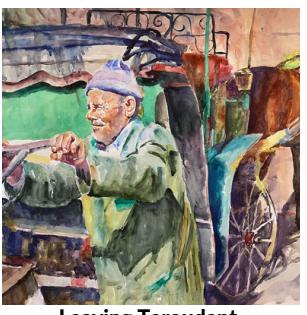
Leaving Taroudant, Kathleen Durdin, 30" x 38", $1250