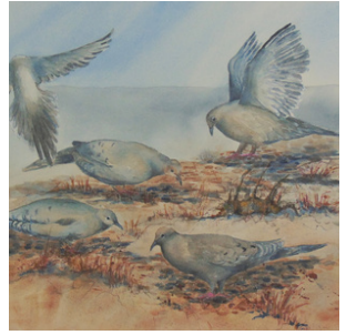
Doves , Autry Dye, 21" x 29", $600