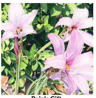
Rain's Gift, Elena Scibelli, 21" x 28", $1000