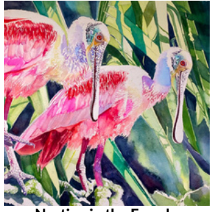
Nesting in the Fronds, Sherry Allen, 30" x 38", $1000