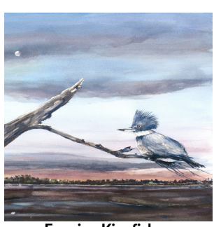
Evening Kingfisher, Nathaniel Pye, 26 3/8" x 32 1/2", $875