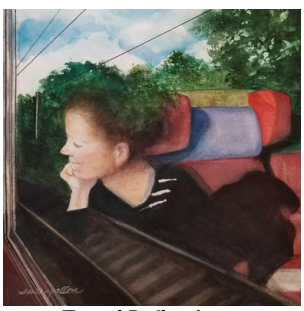
Travel Reflections, Susan Allen, 21" x 17", NFS