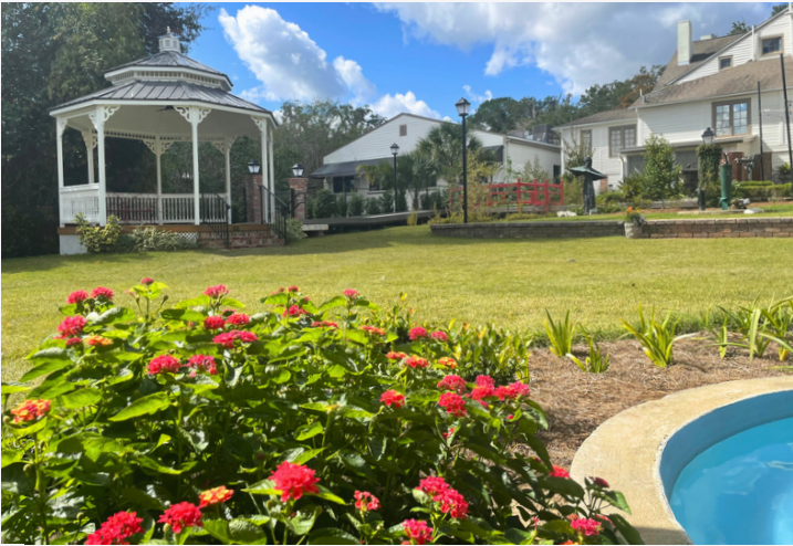
A sunny day in LeMoyné Art's back garden.

LeMoyné is very grateful for this opportunity to improve its facilities to better serve our community for decades to come.