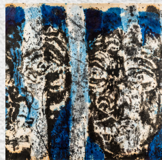
Karl Zerbe, White Bars #4