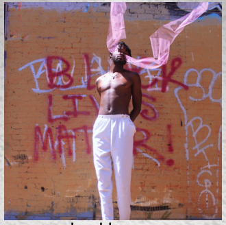
Jae House, Weary Man Weeps 2, $222