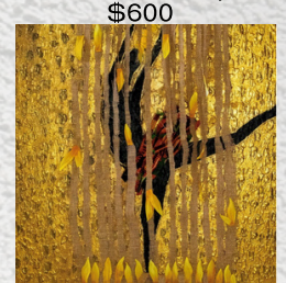
April Fitzpatrick, Fortitude, NFS