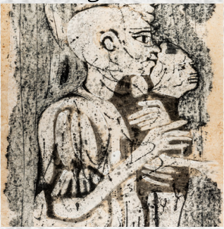
Karl Zerbe, Bystanders #1