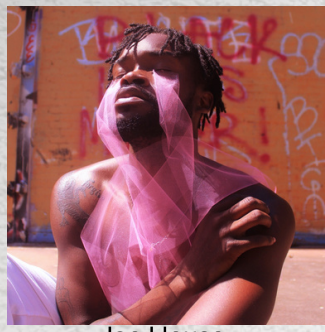
Jae House, Weary Man Weeps 3, $222