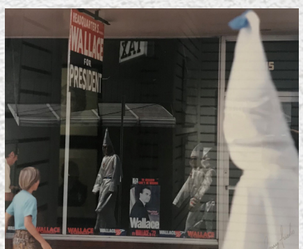
Ku Klux Clan marching in the street