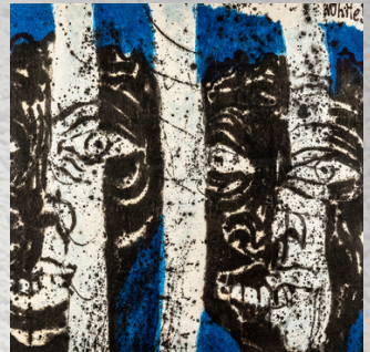
Karl Zerbe, White Bars #3