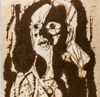
Karl Zerbe, Singing Woman #1