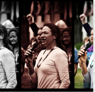
Katie Clark, Civil Rights Through the Decades Triptych, $150