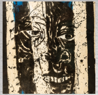
Karl Zerbe, White Bars #1