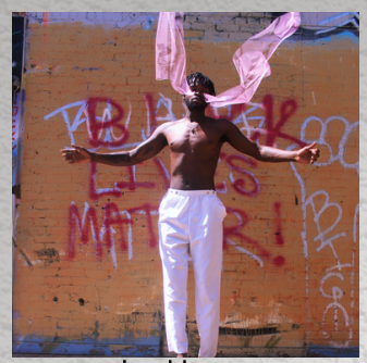
Jae House, Weary Man Weeps 1, $222