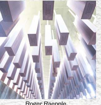
Roger Raepple, Lynchings (The National Memorial for Peace and Justice), $400