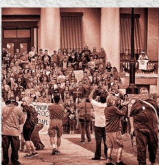
Katie Clark, In Protest, $100