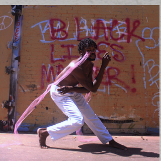
Jae House, Weary Man Weeps 6,