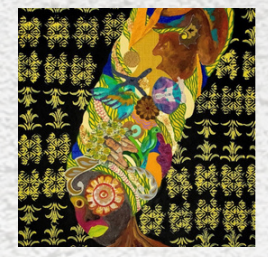
April Fitzpatrick, Rooted Reflections, NFS