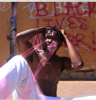
Jae House, Weary Man Weeps 5, $222