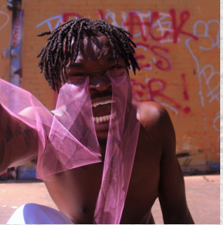
Jae House, Weary Man Weeps 4, $222