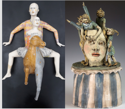
Figure in Form: Barbara Balzer & Lesley Nolan