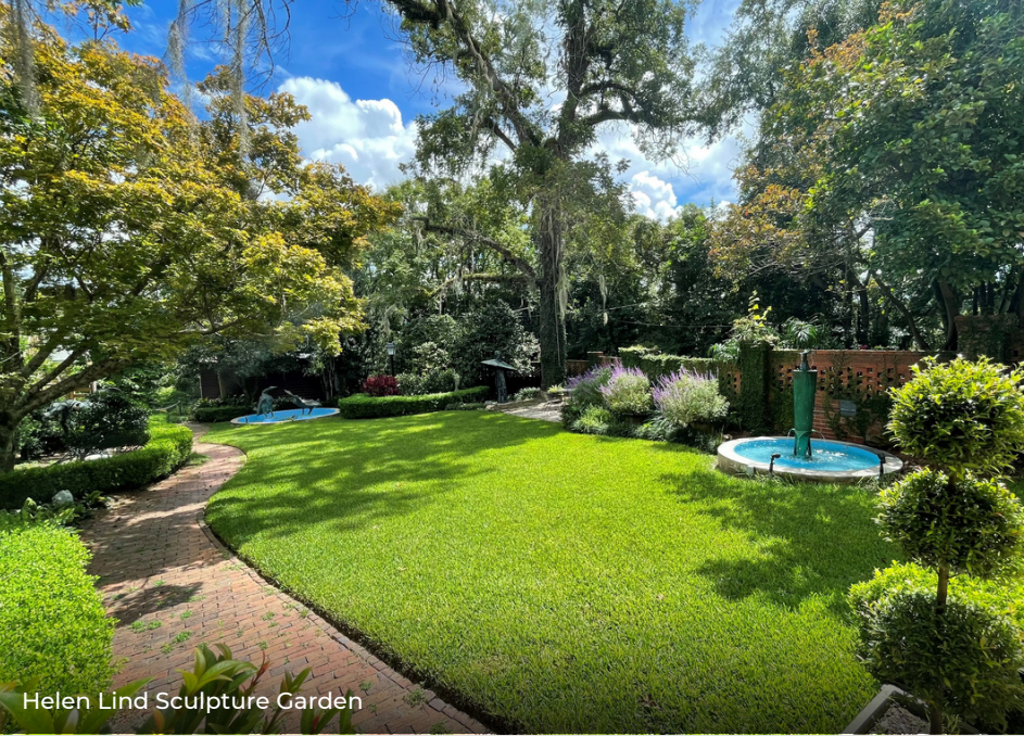
Helen Lind Sculpture Garden