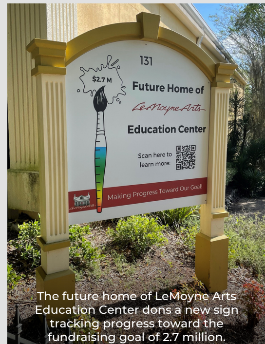
The future home of LeMoynes Arts Education Center dons a new sign tracking progress toward the fundraising goal of 2.7 million.