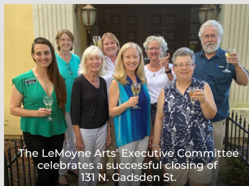
The LeMoynes Arts' Executive Committee celebrates a successful closing of 131 N. Gadsden St.