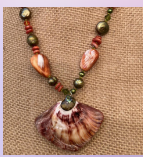
Spondylus Pendant 24" Necklace, $175