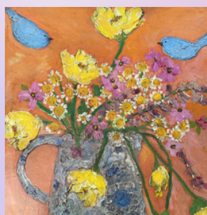
Yellow Flowers Open My Heart Acrylic on Wood, 24" x 18", $675