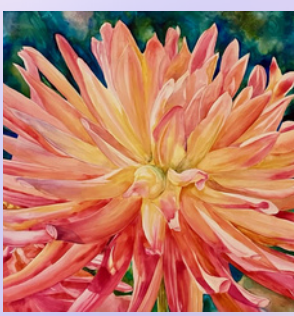
Cali Dahlias I Watercolor, 24" x 36", $1200