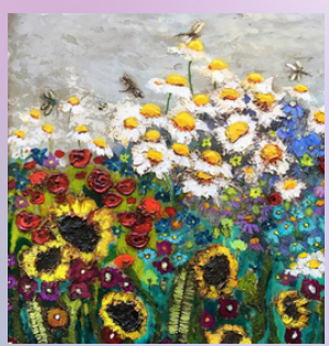
Tower of Daisies Acrylic on Wood, 30" x 36" , $1600

to carve into the wet paint creating a kind of three-dimensional sculptural rendering. "I'm fearless when it comes to experimenting with color and texture, my technique is always evolving. I live in a swampy, heavily wooded area with trails and boardwalks leading to endless natural vignettes that offer inspiration. Occasionally I like to hide a song lyric in a nest or embed a treasure found outdoors (a leaf, wing, feather, etc.) in a painting to capture my love for music and nature in my work."