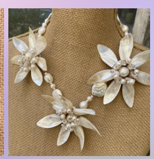
Hawaiian Flower Lei 20" Necklace, $250