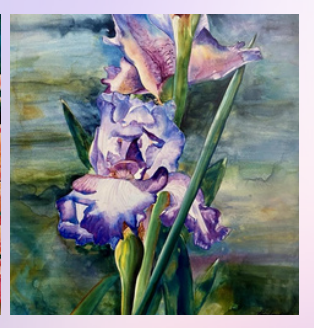
I got the Blues from Ron Watercolor, 36" x 24", $1200