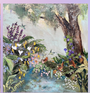
Spring Forest Acrylic on Wood, 48" x 48", $3600