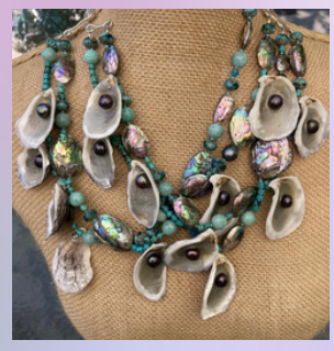
Oyster Mom's Oyster Cache 20" Necklace, $400

vibrant colors to express themselves is engaging. I always find myself moving towards "found objects" that create a story. Whether it be a collection of lockets, or a flotilla of exotic shells, I love creating a visual dialog that a person can wear."