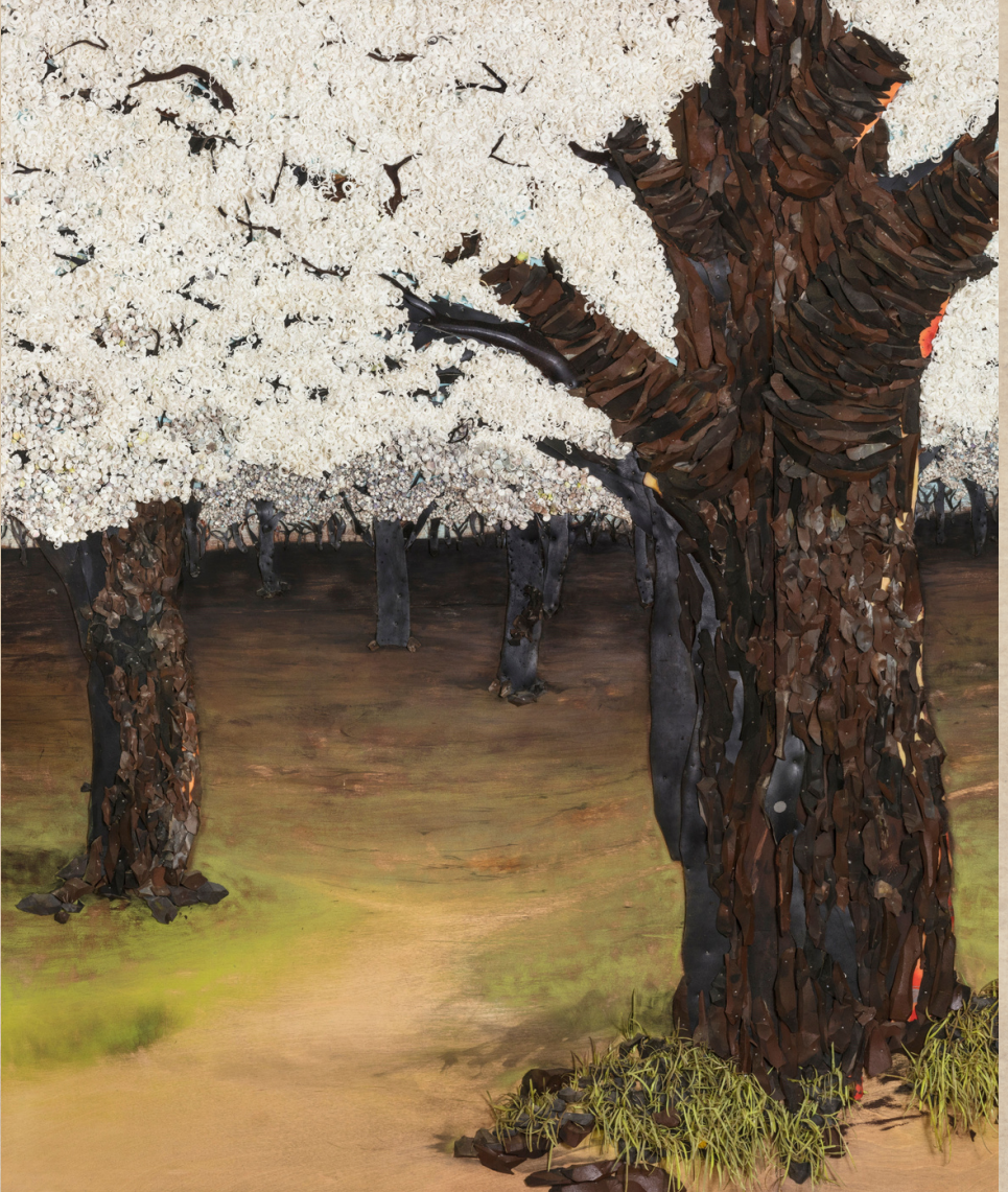
Sakura. Lana Shuttleworth, Safety cones, stage flooring, water bottles, etc., 48" x 159.5", $21,500