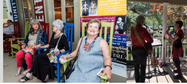
Exhibit Sponsorship Packet

Thank you for your interest in becoming a sponsor for LeMoyné Arts' exhibits and programming. Your sponsorship helps provide our community with great exhibits and events.