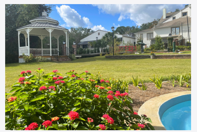
A sunny day in LeMoyne Art's back garden.