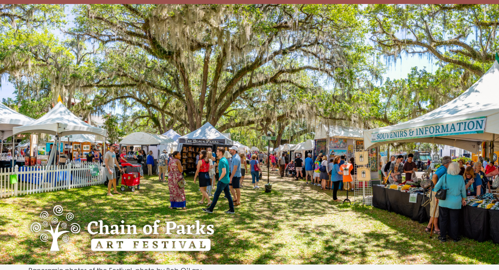
Panoramic photos of the Festival