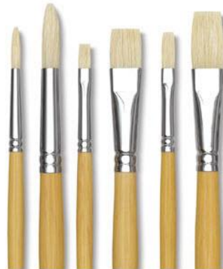
Large Set (enlarge)