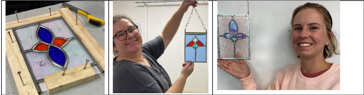
Beginner Projects Completed at LeMoyne Arts

Students can choose one simple Victorian or Prairie Style design for their first project. Typically, these measure approximately 5 by 8 inches (less than 0.5 square feet) and contain fewer than ten pieces. They usually take two to three weeks to complete.