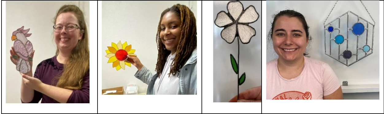
Second, more advanced projects completed at LeMoyne Arts

Experienced students often tackle especially challenging projects. Before proceeding, the instructor will ensure that your design is within your skill level. If your project requires special glass or items not available in the studio, LeMoyne Arts may ask you to purchase those materials from an outside supplier. LeMoyne Arts does not sell glass, tools, or related materials.